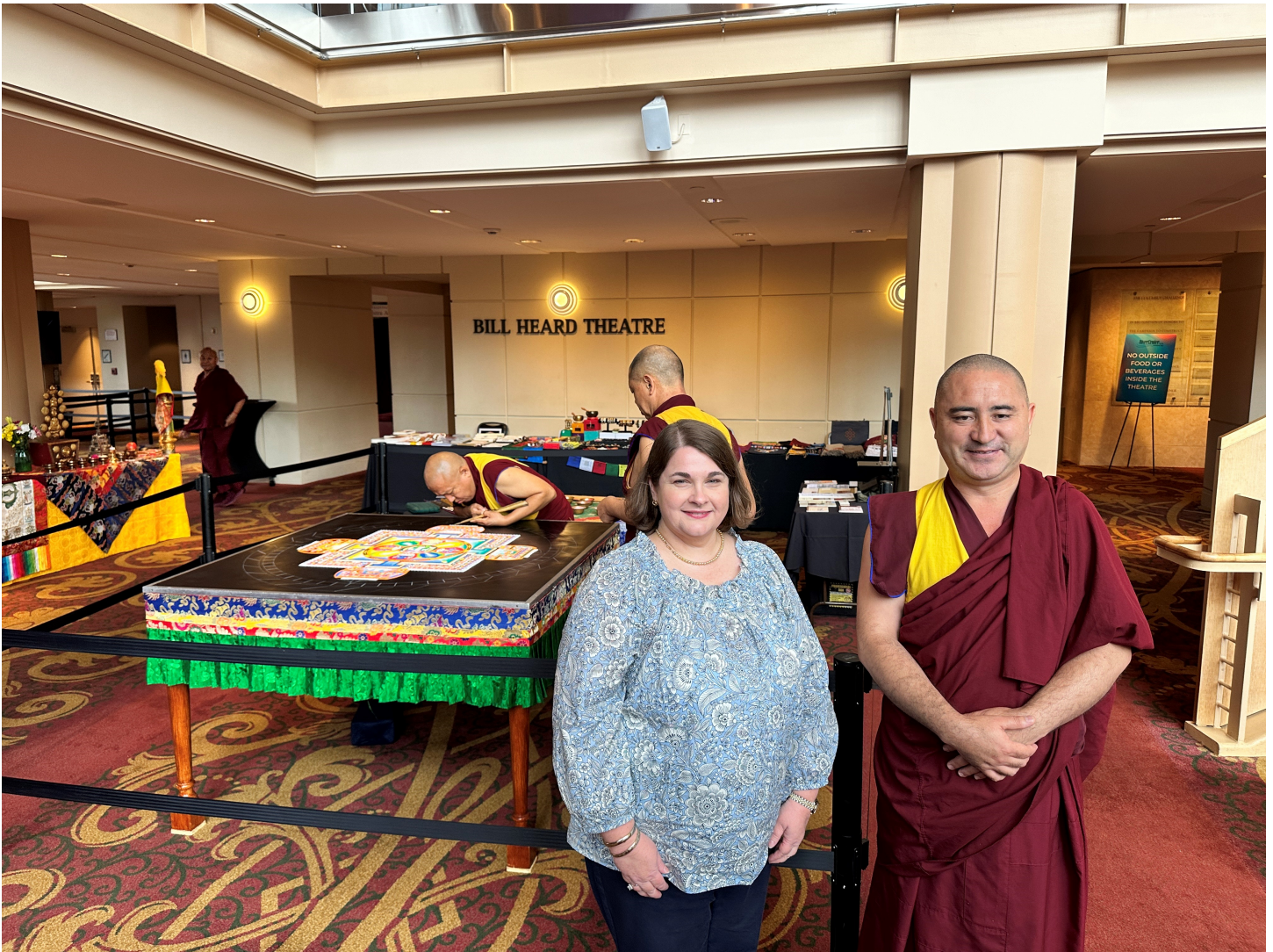
Posted by LeighAnn Dicesaris October 2, 2024