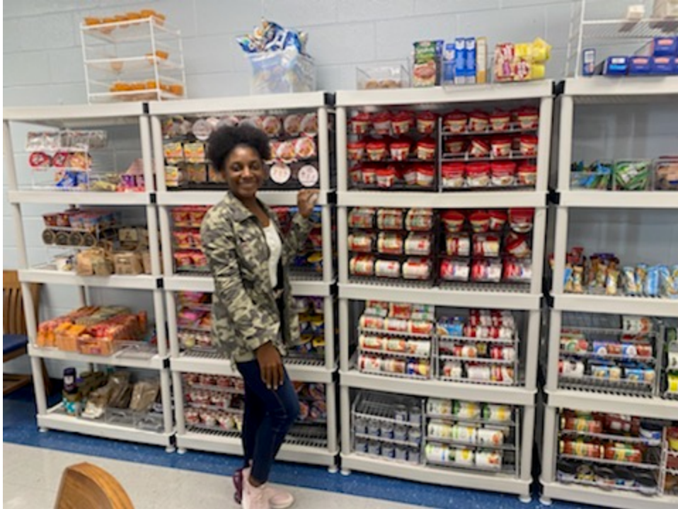
Posted by Laurie Lewis December 3, 2021