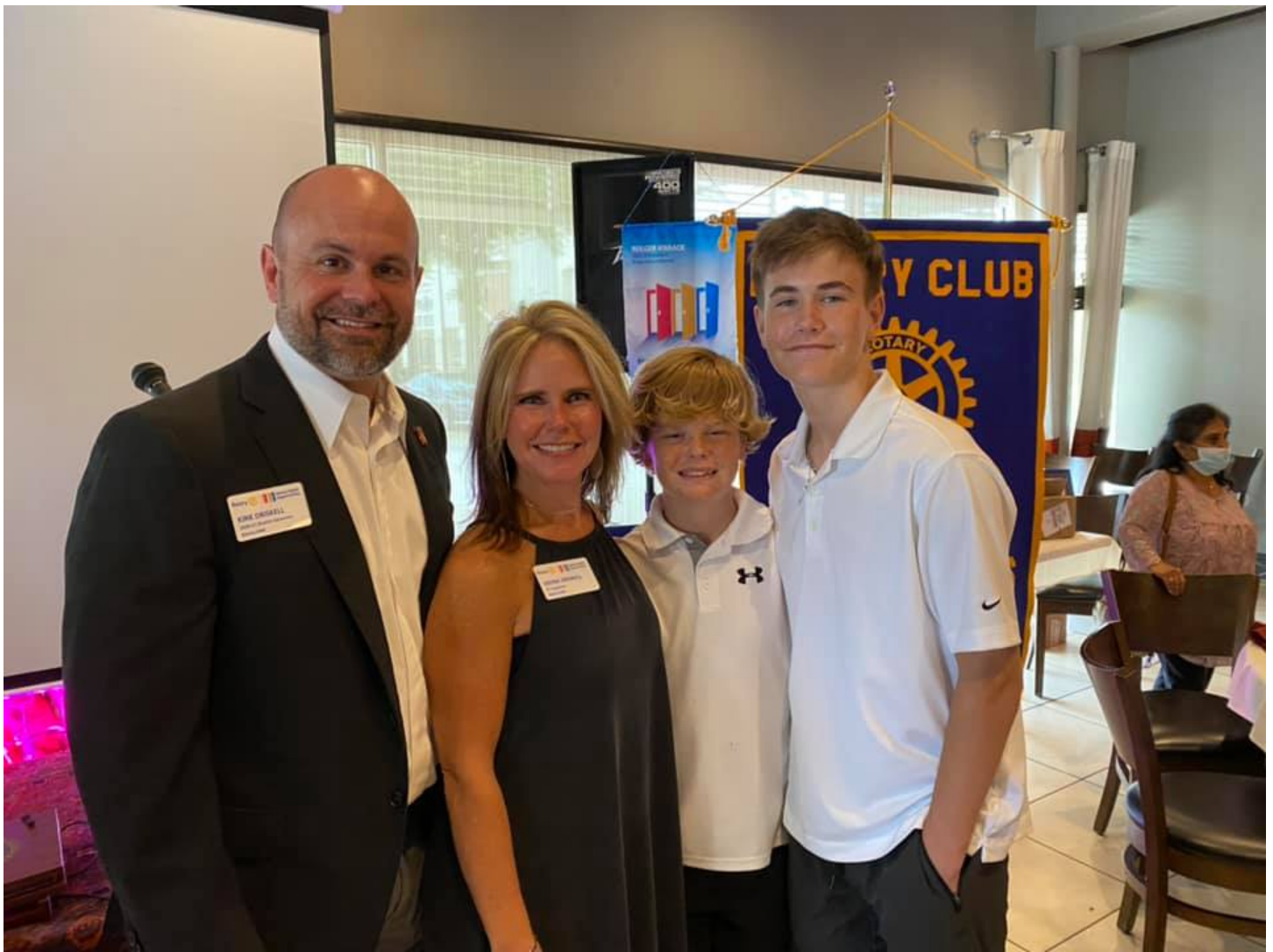
Posted by Kirk Driskell July 6, 2020