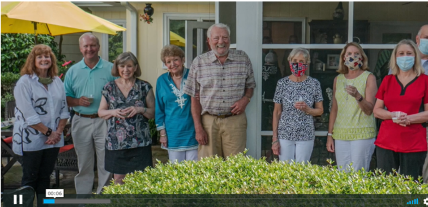
Editor's Note: These four sets of pictures and stories were collected from club Facebook posts.