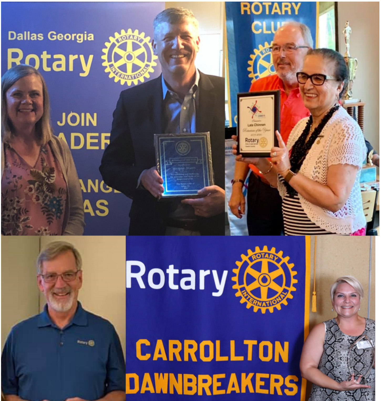
Posted by Jackie Cuthbert July 13, 2020