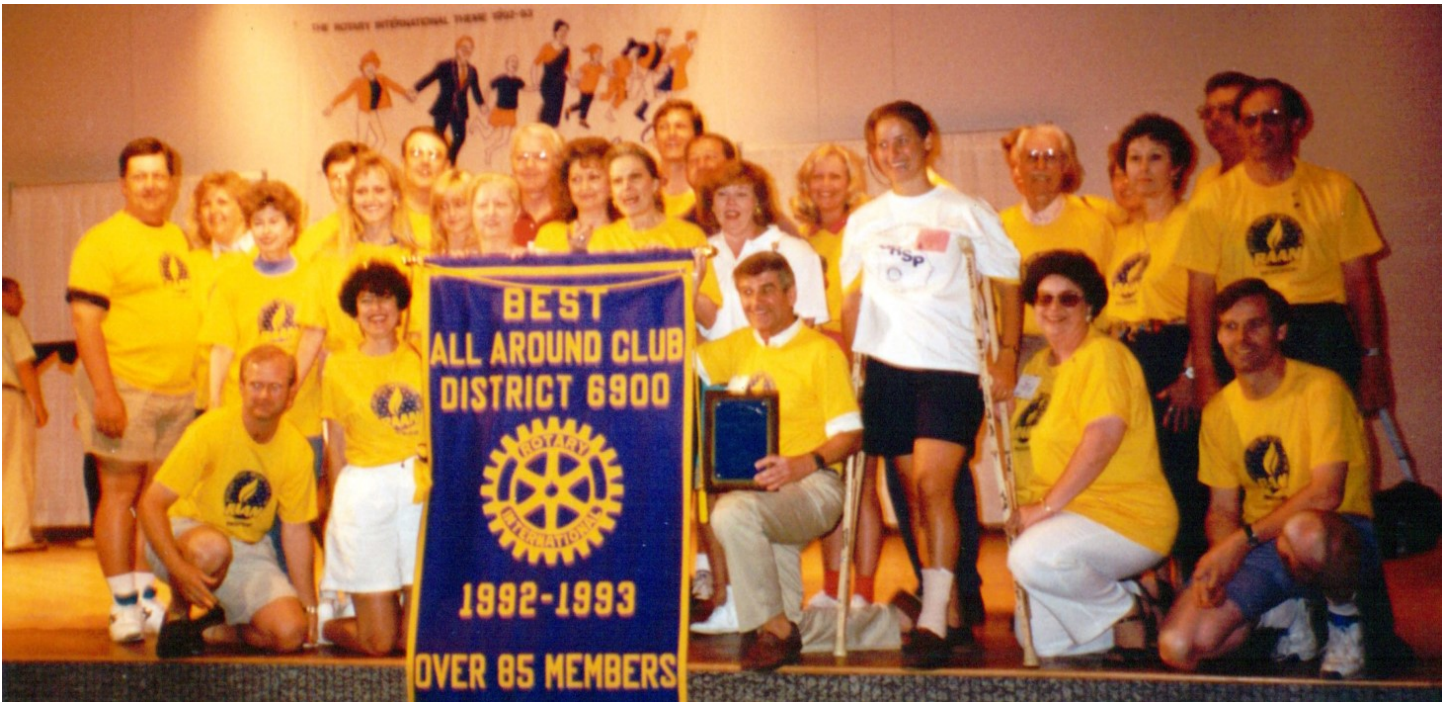
Posted by Ron Swofford July 7, 2020