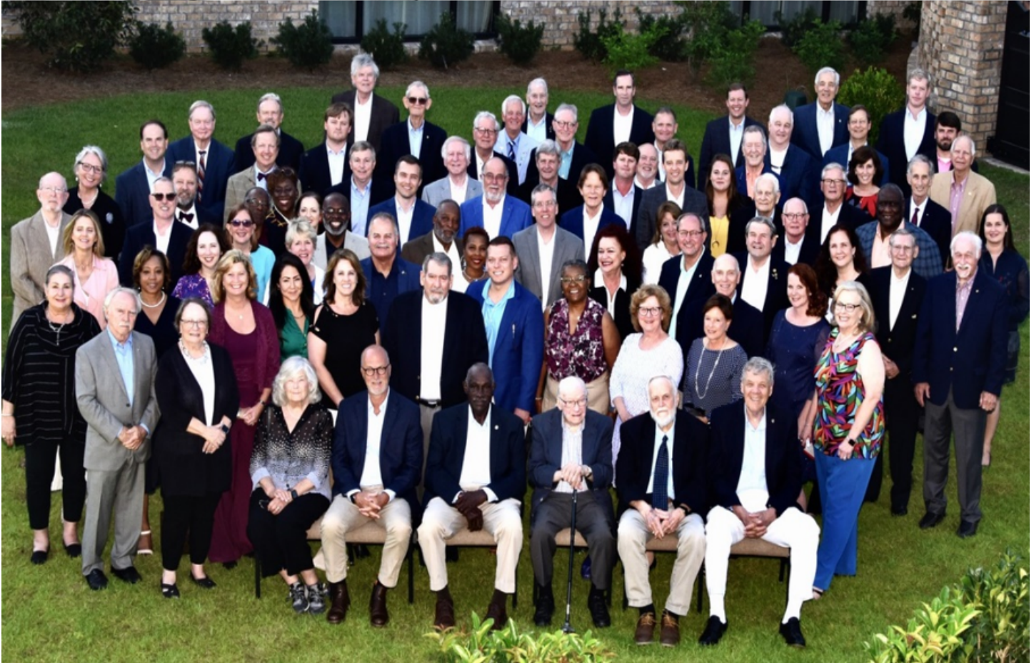
The Rotary Club of Thomasville was officially launched in the first week of May 1921. Exactly 100 years