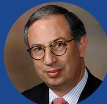
Carlos del Rio